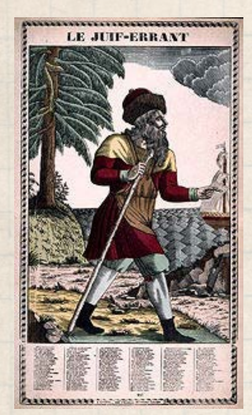
Late nineteenth-century depiction of the Wandering Jew.

The Wandering Jew, whose story is woven into the narrative of Underneath the Lintel, is a figure from medieval Christian lore that spread widely in Europe in the thirteenth century and became a fixture of Christian mythology and literature. It concerns a Jew who, according to legend, taunted Jesus on the way to the Crucifixion and was then cursed to walk the earth until the Second Coming.