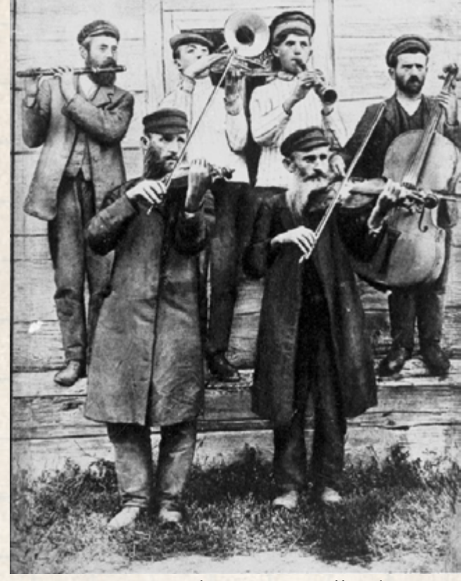
Klezmer musicians at a wedding, Ukraine, ca. 1925